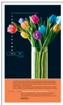
8.5" x 14" Legal